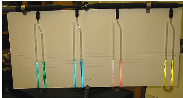
Air flow off